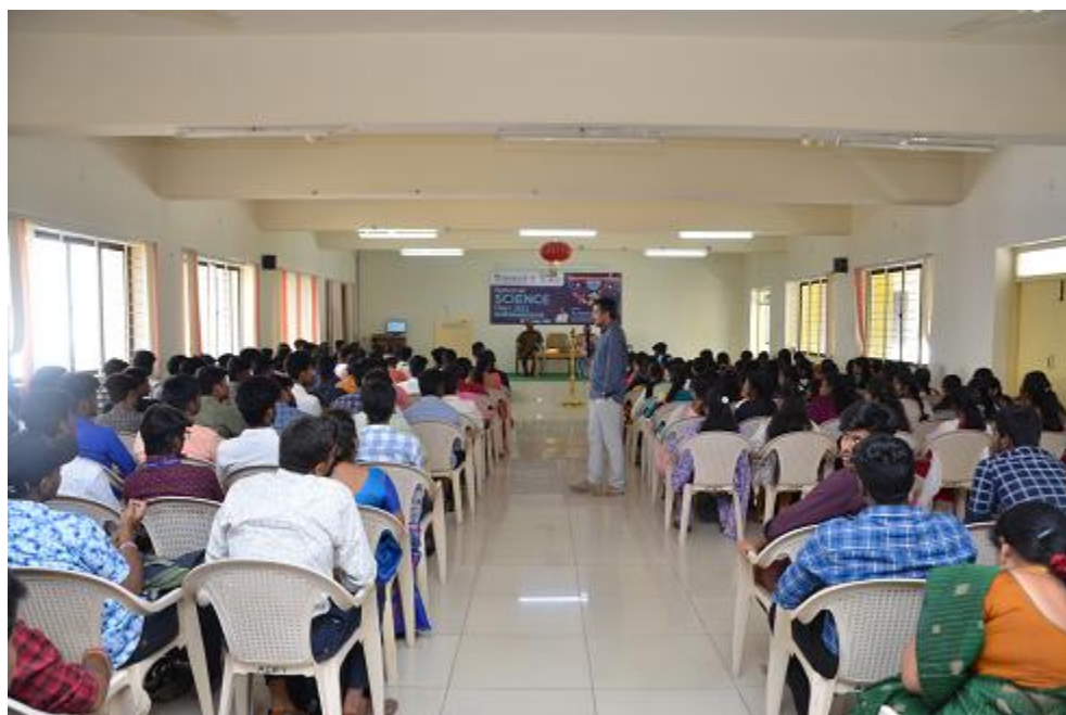
Student participating National Science Day Celebration -2023